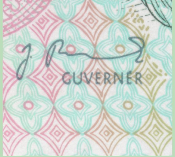
Governor's signature "J. Rusnok"